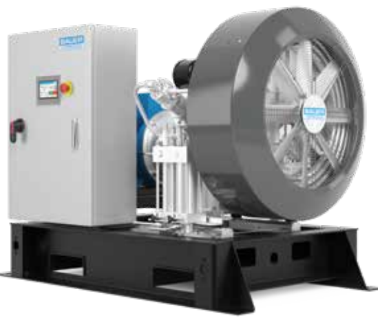
> Shown with optional heavy-duty skid