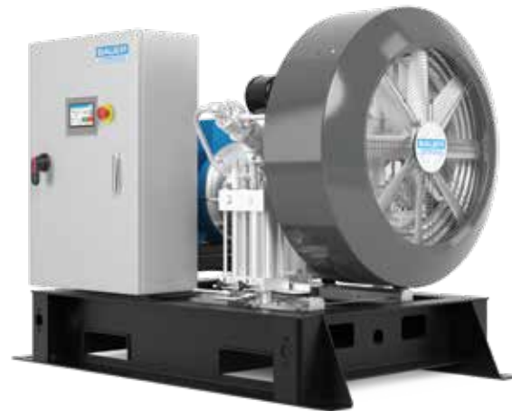
▶ Shown with optional heavy-duty skid