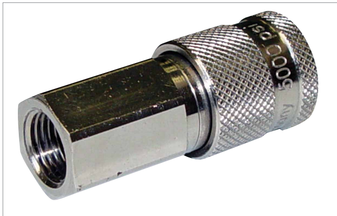
5000 PSI RATED FILL COUPLING Integrated shutoff valve to protect against hose whipping. Available only from BAUER.