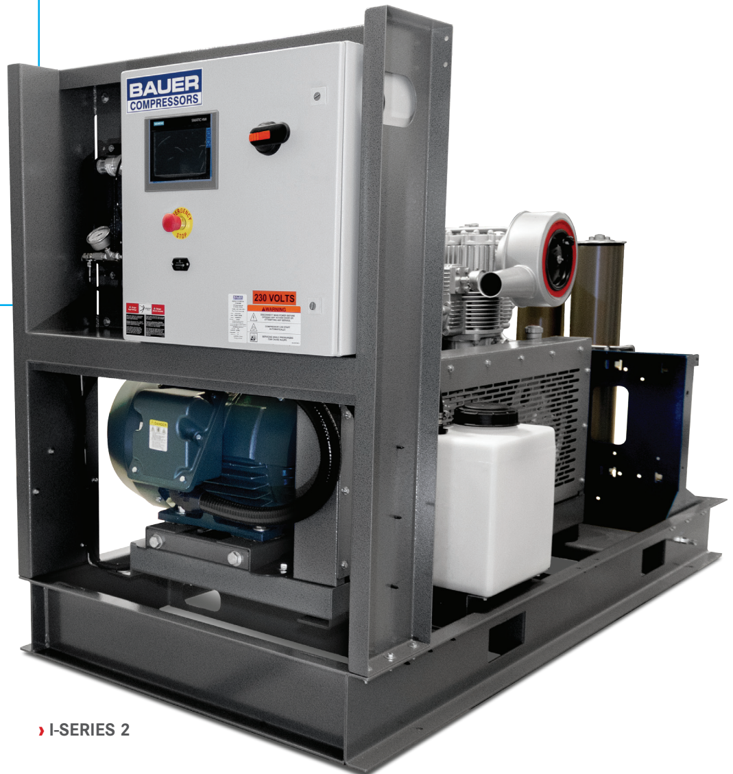
› I-SERIES 2